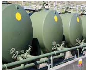
Storage tanks inside a concrete bund.