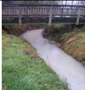
A stream contaminated with surface run-off.

It is important that your bunds are regularly inspected, maintained and collected rainwater regularly removed and disposed of properly.