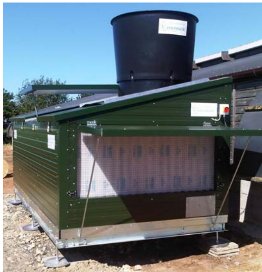
Fig 1. Warmed fresh air is fed into the shed roof space via the insulated pipe. Stale air from the shed is drawn from the side of the building and expelled via the black stack on the roof of the unit.