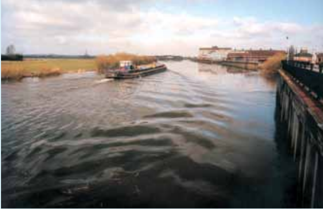
The Trent Aegir can be viewed from the flood defences at Gainsborough.

You can view the Trent Aegir between Derrythorpe and Gainsborough. The most popular viewing sites are: