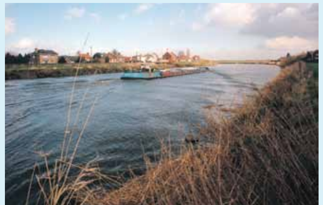
The viewing points at East and West Stockwith lie on opposite sides of the river.