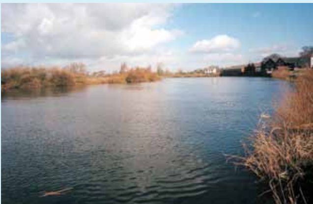
The view at Morton.