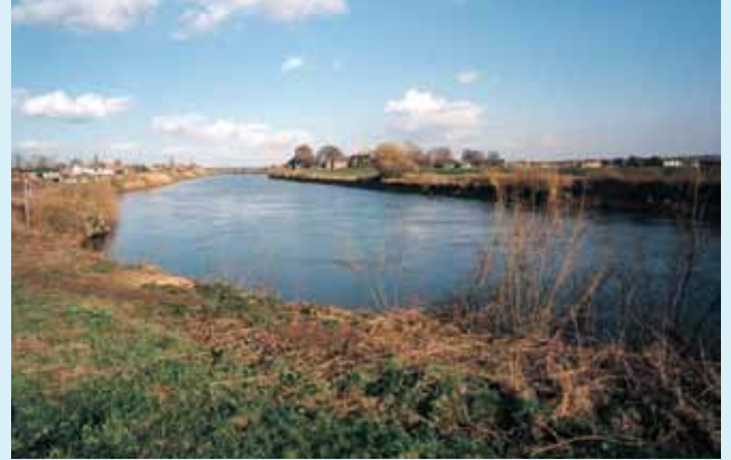
Owston Ferry and East Ferry lie on opposite sides of the river and are good places to view the Trent Aegir.